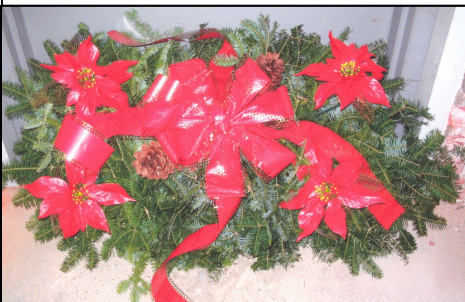
Grave Pillows and Blankets also available!